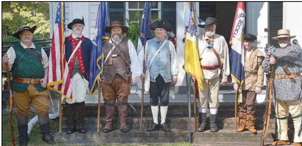
SCSSAR Color Guard