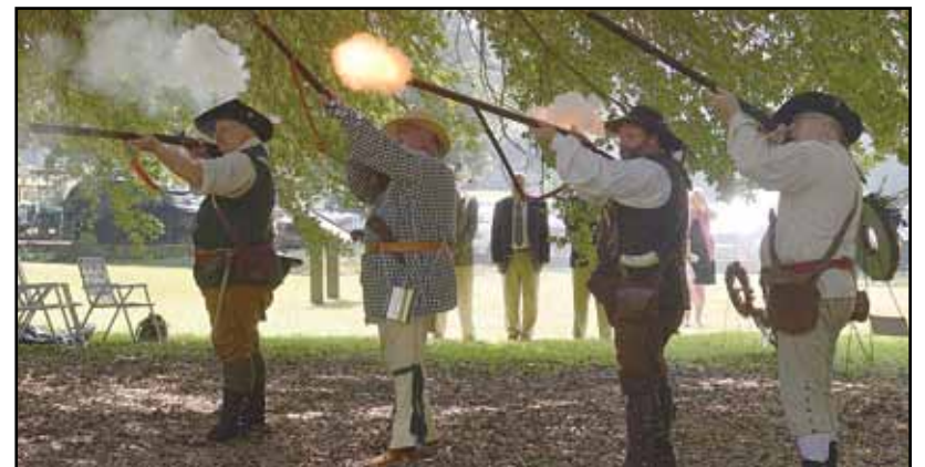
Rifle Volley